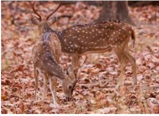
Bandhavgarh National Park 📍