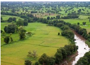
Bandhavgarh National Park 📍